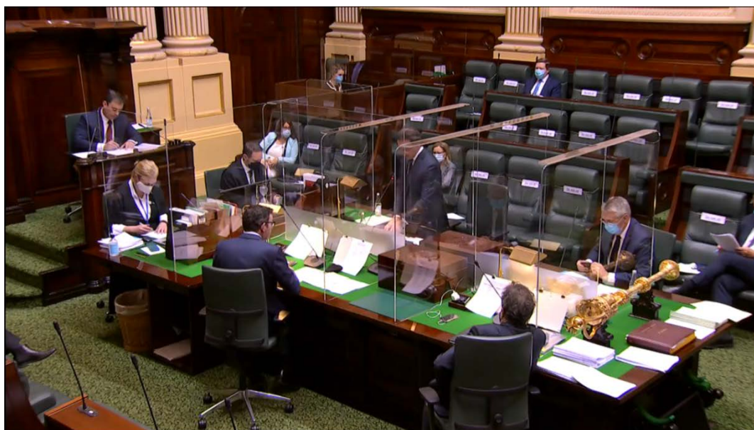
Perspex screens, masks, minimum quorum and social distancing in the Legislative Assembly of Victoria

During the height of the second wave of the pandemic, the Victorian Legislative Assembly conducted socially distanced proceedings in the Chamber with a bare quorum of masked members who spoke from behind banks of perspex screens. Given the severity and duration of the crisis in the State, from 3 September, some members were also permitted to participate in debate in the Chamber via audio link or video link, although, as with the Federal Parliament, they were not counted as present for the purposes of a quorum, nor could they vote in divisions. Members participating remotely could, however, 'register their opinion on the question'—either 'yes' or 'no'—by notifying the Clerk in writing, and this opinion would be published in Hansard and the Votes and Proceedings. 179