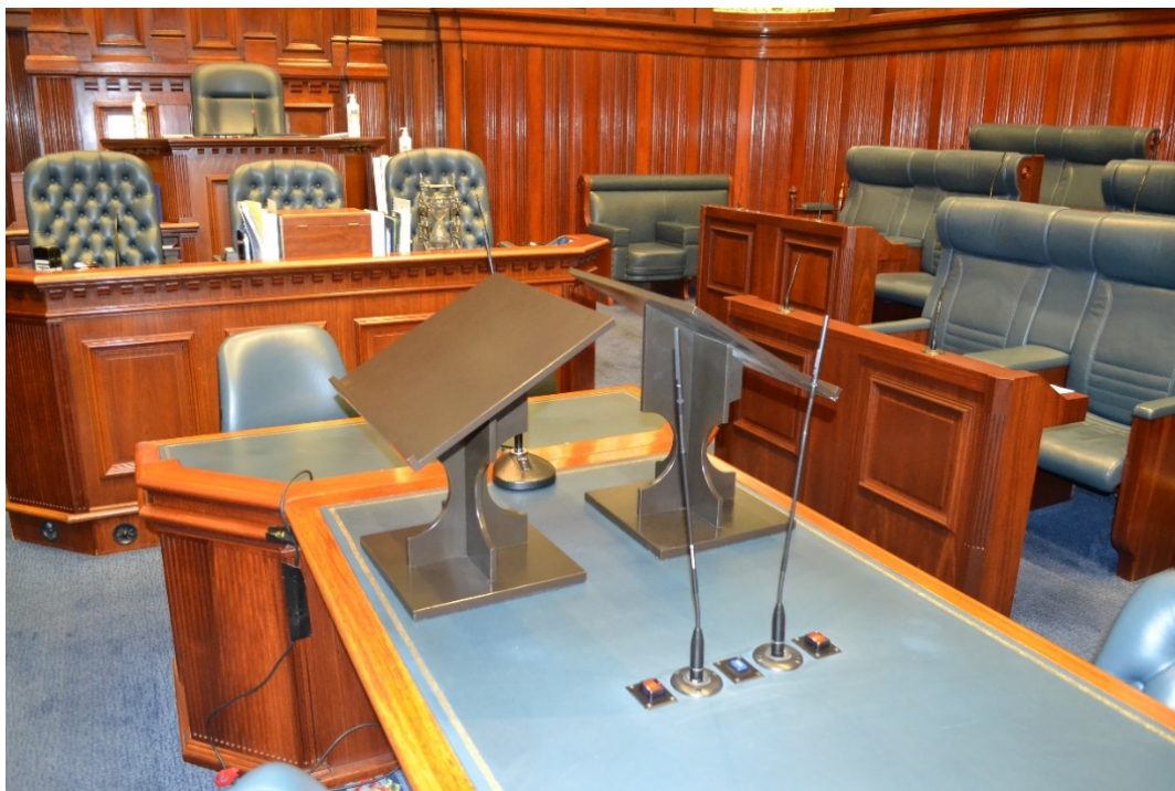
The lecterns and open mics on the Table of the House

To prepare for remote support of Chamber proceedings, the Clerk had requested all Assembly parliamentary officers to work from home for at least one day during the recess to trial remote access through their allocated VPN licence, and to install and become familiar with the videoconferencing platform Zoom. The Clerk also arranged for additional deep cleaning of the Assembly commencing from Monday 30 March. This service saw all touchable surfaces in the Chamber being cleaned with Virkon, a hospital-grade, multi-purpose disinfectant, every evening in preparation for the next day's sitting.