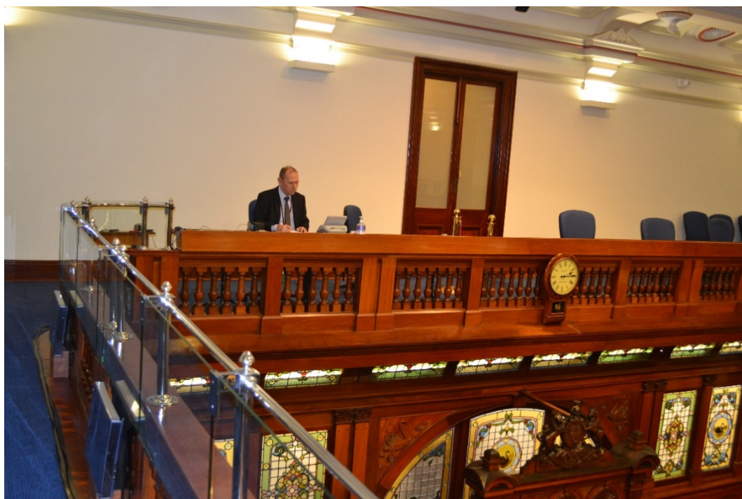
Hansard reporting from the upstairs Press Gallery

The motion passed unanimously. Nineteen members were marked as absent.