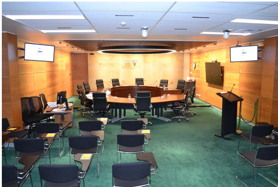
Socially distanced set-up in Committee Room 2 for Estimates hearings

The block of days set aside for Estimates hearings, Tuesday 20 October to Thursday 22 October, had originally been scheduled as sitting days. Given additional days had been inserted into the 2020 sitting calendar to deal with COVID-19 legislation and the Budget, a decision was made by the Government to re-allocate these days to Estimates. As the Legislative Council was sitting this week, however, the Assembly was unable—as was customary practice—to hold the Estimates hearings concurrently in both Chambers.