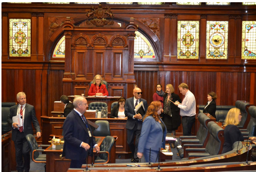
Members filing through the Chamber during a walk-through division

Thursday 14 May saw three COVID-19 related brief ministerial statements. The Treasurer announced that due to the impact of the pandemic, the State Budget would be delayed until 8 October and he further outlined the Government's economic recovery strategy; the Minister for Small Business informed the House about the work being undertaken by the Small Business Corporation to support the State's small business operators; and the Minister for Community Services acknowledged the work of family and domestic violence specialist services during the pandemic. This day saw the reinstatement of grievances and private members' statements and a number of these raised issues relating to the pandemic. When adjourning the House, the Leader of House advised that notwithstanding the postponement of the Budget, the three days of sittings on 26, 27 and 28 May which had been scheduled for Budget Estimates, would be retained as an ordinary sitting week.