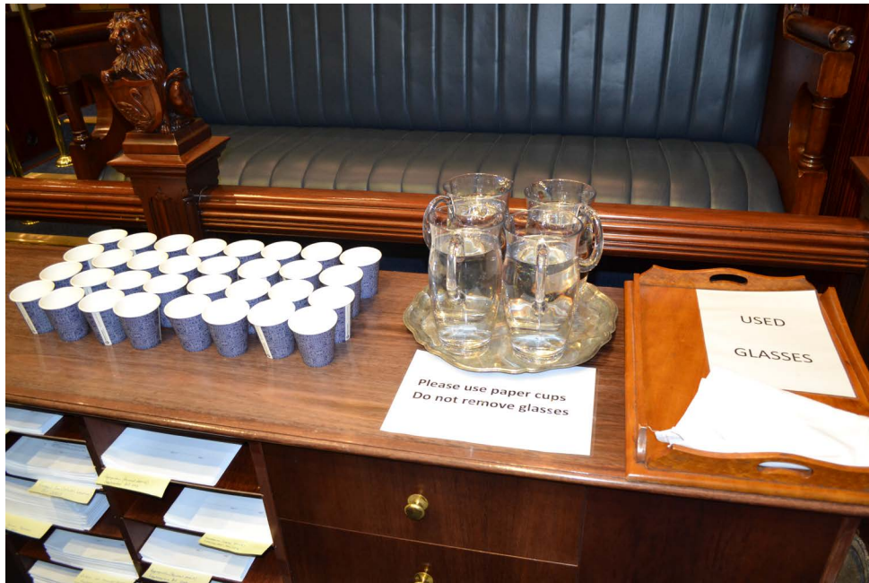
Disposable cups for water at the back of the Chamber

activities at aged care facilities to protect vulnerable elderly residents; banning of non-essential travel to remote Aboriginal communities; and that schools and universities were to remain open. 30 News also came through that the Queensland Parliament had cancelled that day's sitting and had passed an emergency motion the previous evening that would enable it to suspend sittings for six months, if necessary. 31