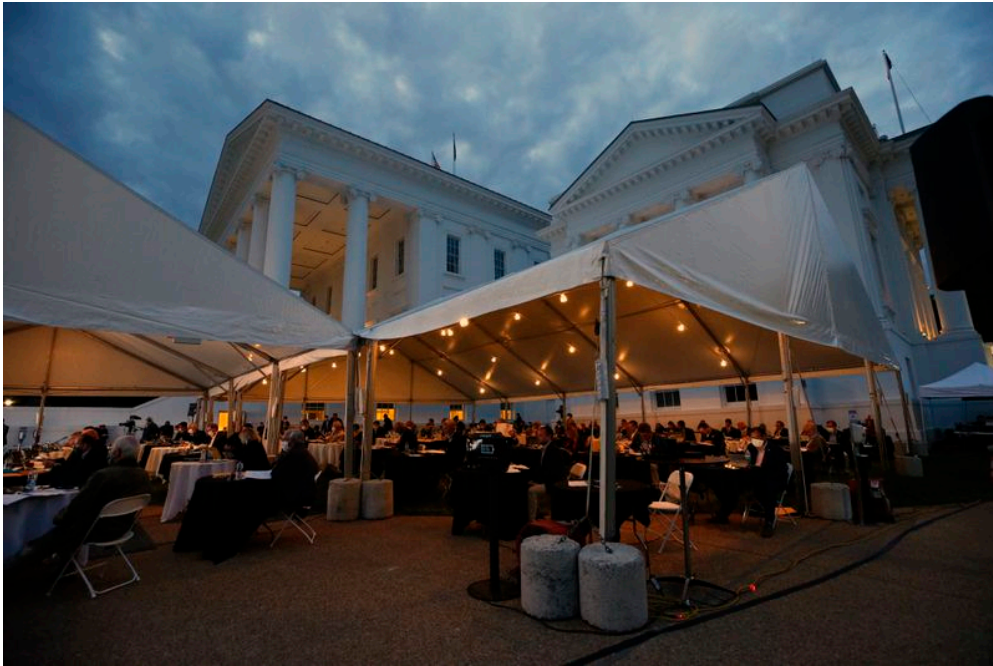
The Virginia House of Delegates meeting under a marquee on the grounds of the Capitol

To comply with social-distancing requirements while holding their in-person sittings, a number of Australian legislatures have expanded the usable floor space of their Chambers by officially incorporating their Presiding Officers' galleries (as did the Western Australian Legislative Council and the South Australian House of Assembly) or by allowing members to sit in and participate in proceedings from their upstairs Public and Press Galleries (as did the Legislative Council of New South Wales).