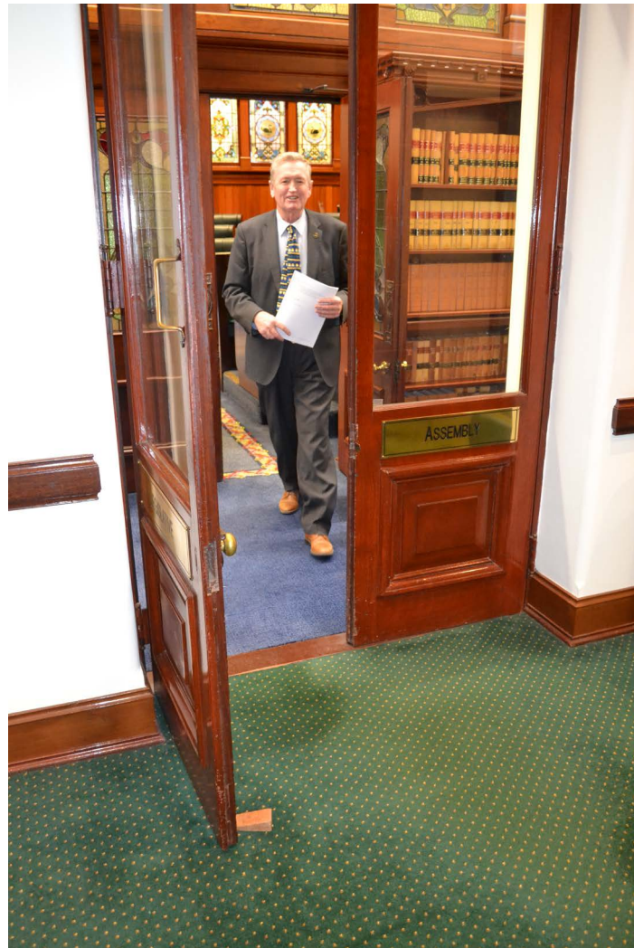
A member exiting the Chamber through the propped doors

fewer members, only 16, were absent from the day's sitting and that over the week, four non-COVID bills would be introduced.