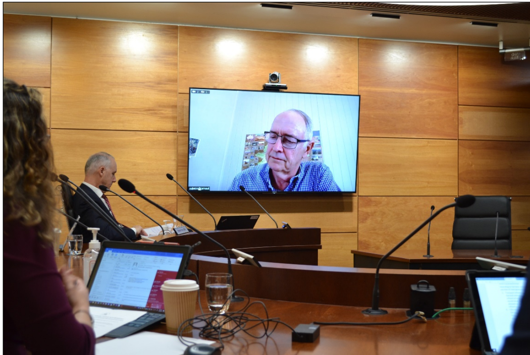
Economics and Industry Standing Committee socially distanced hearing into the economic impact of COVID-19 with a witness appearing by Zoom

committees of the UK House of Commons used Zoom for public hearings, but swapped to Microsoft Teams for confidential deliberations. The Parliament of Western Australia's existing IT infrastructure does not support Microsoft Teams. The PPC urges the Parliament to identify and implement as a matter of priority a videoconferencing platform which is suitable for conducting confidential and highly sensitive meetings and hearings.