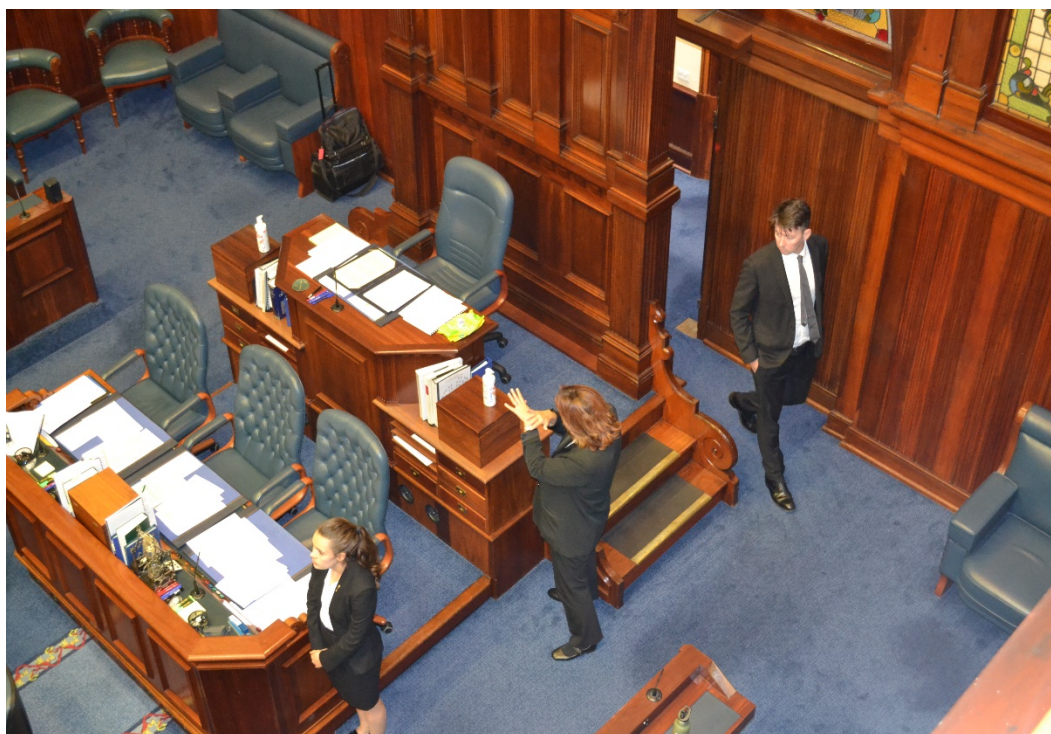
Parliamentary officer applying hand sanitiser prior to the commencement of a sitting