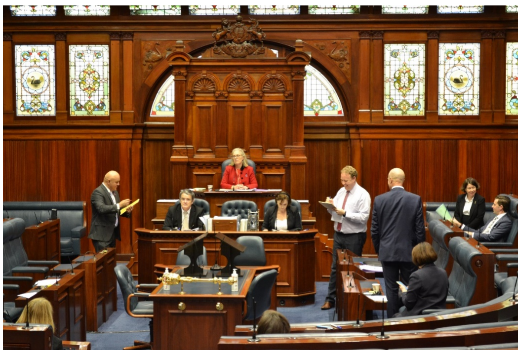
Tellers finalising the results of a division, without members needing to remain in the Chamber

Members were surveyed in June regarding their assessment of the Assembly's response measures to the pandemic in the Chamber and 90% of members indicated they thought the response was 'very good' or 'good'. 128 The Speaker, as Chair of the PPC, also invited members to provide feedback via written submissions to the PPC regarding the Legislative Assembly's special COVID-19 arrangements and whether any should be retained in a non-pandemic environment. (See Appendix 5 for the list of submitters.)