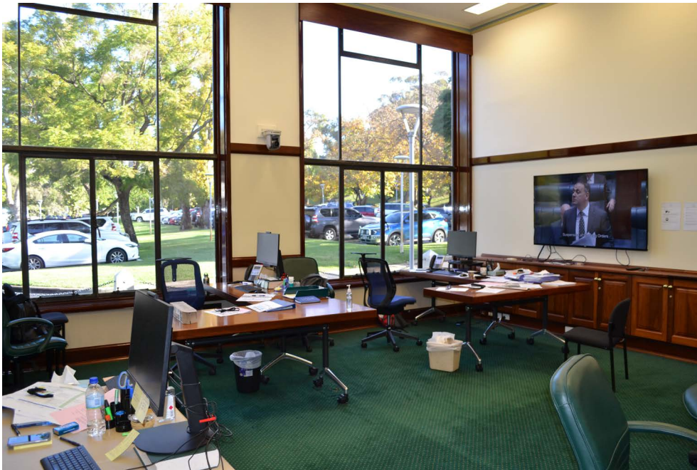
Socially distanced work stations in the Legislative Assembly Meeting Room

Phase 2 of the WA Roadmap came into force on Monday 18 May. While Western Australians were still enjoined to practise good hygiene and comply with the 1.5 and four-square-metre rules, they were now allowed to gather in groups of up to 20; restaurants, bars, cafes and other venues could open with a 20-patron limit; most regional travel restrictions were lifted; and Western Australians were encouraged to return to work unless unwell or vulnerable. 93 By this stage all Assembly House staff were working in the building on sitting days. To ensure that the four-square-metre rule could be complied with, three officers were relocated from the Legislative Assembly Office to the adjoining Legislative Assembly Meeting Room on 15 May.