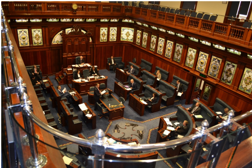
The socially distanced Legislative Assembly during the COVID-19 pandemic

On Thursday 28 May, the Treasurer provided an economic and fiscal update referencing the devastating effect of the pandemic, and two private members' statements also referred to the pandemic. For the remainder of the day, the House dealt with non-COVID legislation. At its rising, the House was adjourned until 16 June—a two-week recess.