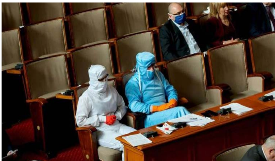
A sitting of the Bulgarian National Assembly in March 2020

The PPC is of the view that the Speaker has the authority to insist that a member not enter, or remove themselves from, the Chamber, if they are exhibiting flu-like symptoms or refusing to wear a face mask in the middle of a pandemic. Furthermore, the PPC believes that the Speaker would, and should, enjoy the support of the House if suspension was necessary to enforce this common sense approach.