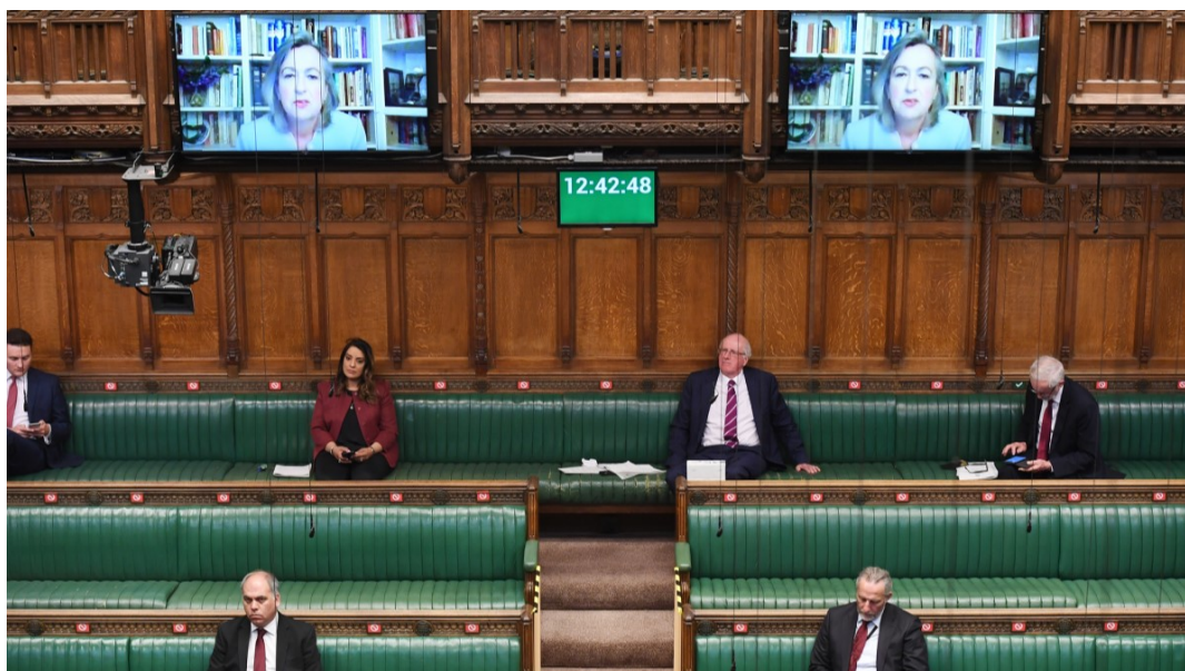
A member of the House of Commons participating in proceedings via Zoom

Commons on 28 September while awaiting coronavirus test results (which turned out to be positive), the Commons has announced that while it will continue with in-person sittings, it will be installing perspex screens in the Chamber. 184 Following the lead of the Commons, the House of Lords similarly moved towards hybrid proceedings, and introduced remote voting on 15 June 2020. 185