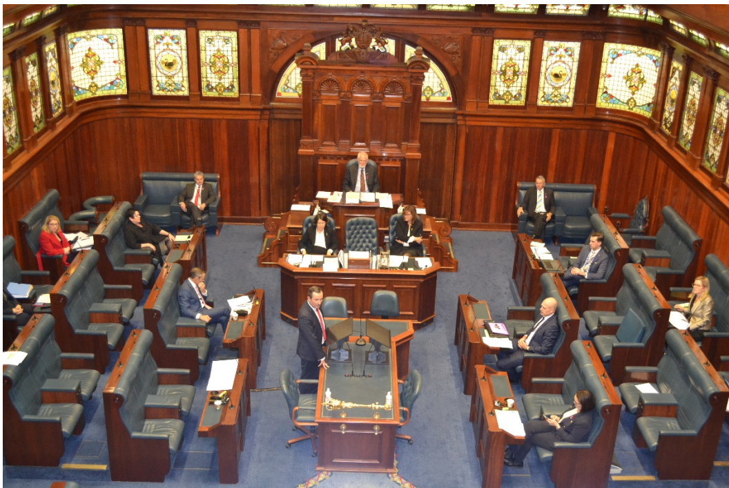
The Premier, Hon Mark McGowan, speaking from a lectern at the Table of the House

The sitting which commenced on Tuesday 31 March was palpably different from normal sittings. The Bar of the House and all doors leading into the Chamber were open to enable entry without members and staff having to touch door handles and push door plates. At the main entrance to the Chamber and distributed throughout the Chamber were bottles of hospital grade hand sanitiser. Not only were there only 22 members on the floor of the House, sitting in the nominated spatially distanced seats, but the Public Gallery was empty following a decision issued on 23 March by the Presiding Officers to exclude the public from Parliament House until further notice. Even most of the press chose to report from their parliamentary rooms. Twenty-two members, having been paired, were marked absent in the Assembly Attendance Book.