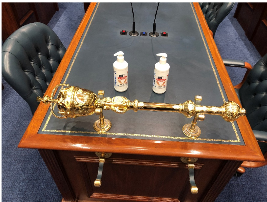
Hand sanitiser on the Table of the House

The first of the truncated Question Times followed. The agreed format was two questions and two supplementary questions from the Liberal Party; one question and one supplementary question from the National Party; and two questions from the Labor Party. All questions related to the coronavirus. Following prior agreement between the parties, only the Ministers who were to be asked questions would be present in the Chamber. The mood was serious and respectful. Unlike the usual more theatrical Question Times, with the 'wall of noise', no member was called to order.