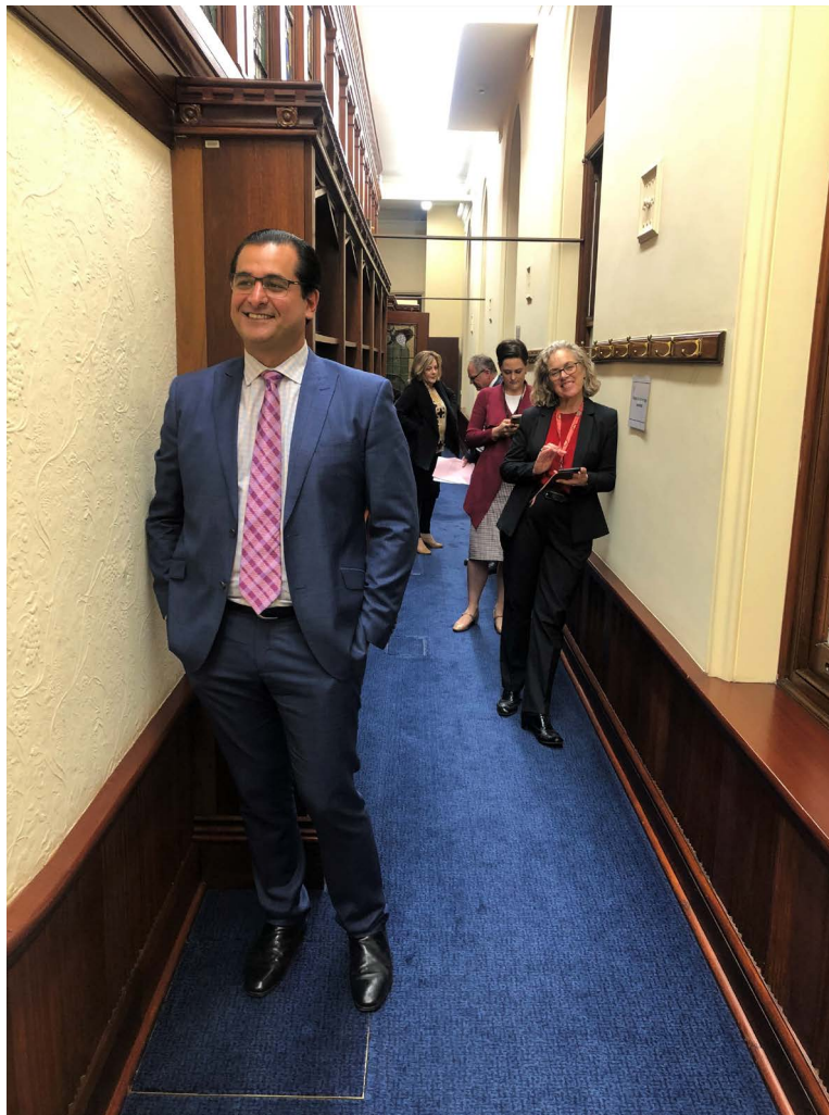
Members' socially distanced queuing before entering the Chamber to vote

Immediately following the third reading of this bill, there followed a suspension debate on the subject of State Government financial relief to regional areas impacted by the intrastate regional border restrictions. At the conclusion of the debate, the House tried out the new division procedure with 54 socially distanced members filing through the Chamber. Only three members were absent from the Chamber during the day—the attendance numbers were almost back to a full House.