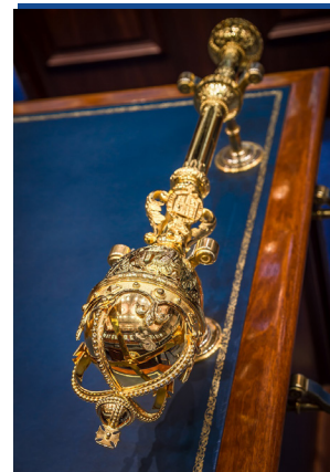
Mace of the Legislative Assembly

The Sergeant-at-Arms is the custodian of the mace which symbolises the authority of the Speaker of the House. The Western Australian mace was designed by the State Works Department in 1887 and was manufactured in South Australia by S. Schlank's Beaver Factory in Adelaide at a cost of £70. Made of silver with gold leaf, it was first used in the Legislative Council in 1888, and was transferred along with the Sergeant-at-Arms to the Legislative Assembly upon its establishment in 1890. It is the oldest Parliamentary mace in Australia.