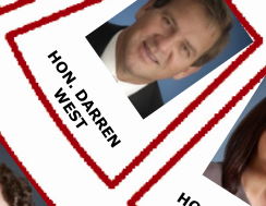
HON. DARREN WEST