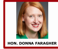
HON. DONNA FARAGHER

MINISTER FOR REGIONAL DEVELOPMENT; AGRICULTURE AND FOOD; MINISTER ASSISTING THE MINISTER FOR STATE DEVELOPMENT, JOBS AND TRADE