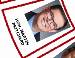
HON. MARTIN PRITCHARD