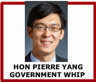
HON. PIERRE YANG GOVERNMENT WHIP