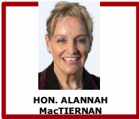
HON. ALANNAH MacTIERNAN

MINISTER FOR REGIONAL DEVELOPMENT; AGRICULTURE AND FOOD; MINISTER ASSISTING THE MINISTER FOR STATE DEVELOPMENT, JOBS AND TRADE