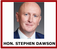
HON. STEPHEN DAWSON

MINISTER FOR ENVIRONMENT; DISABILITY SERVICES