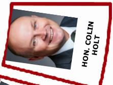
HON. COLIN HOLT