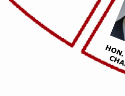
HON. ROBIN CHAPPLE