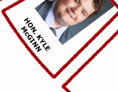
HON. KYLE MCGINN