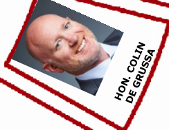
HON. COLIN DE GRUSSA