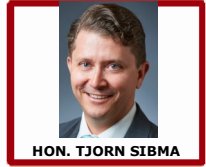
HON. TJORN SIBMA