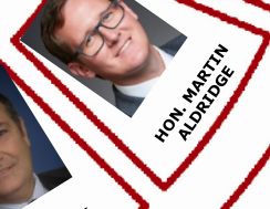
HON. MARTIN ALDRIDGE