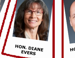
HON. DIANE EVERS