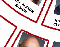
HON. ALISON XAMON