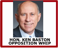
HON. KEN BASTON OPPOSITION WHIP