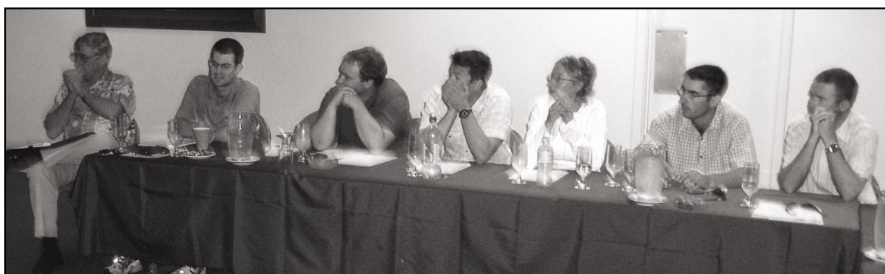
Some Local Surveyors attending the Board Seminar session in Port Hedland.

The Board held a meeting in Port Hedland in August 2004. This was followed by a seminar and forum with the surveyors of the North West region. The discussions enabled an interchange of ideas and the chance for rurally based surveyors to have direct contact with Board members.