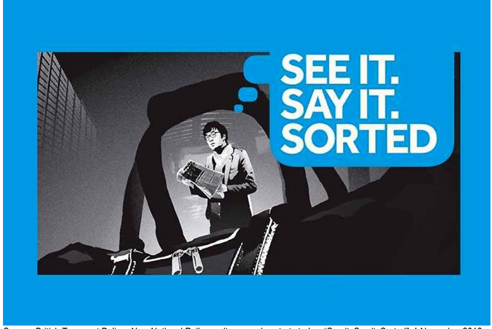
Figure 1.1: British national rail security campaign