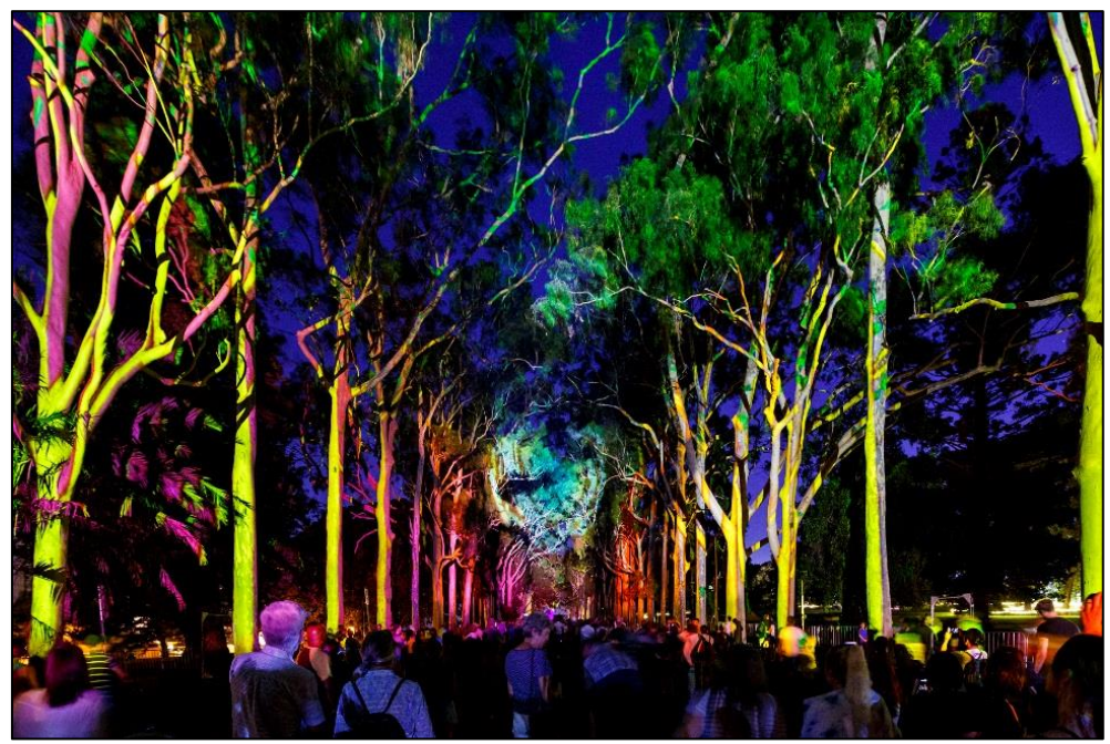
Figure 2.1: 'Boorna Waanginy: The Trees Speak' at Kings Park