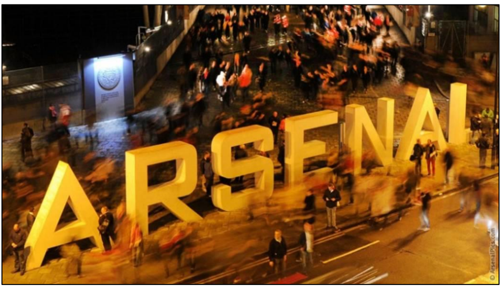
Figure 2.2: Sculpture as vehicle security barriers