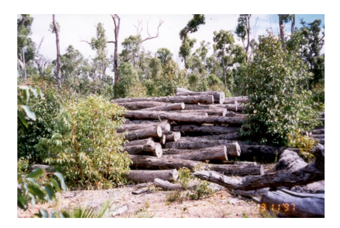
On the left, young jarrah, conservatively aged 2 - 3 years old. On the right, redgum regrowth illustrates that the log pile has been there quite a while.