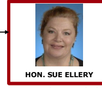
HON. SUE ELLERY LEADER OF THE HOUSE