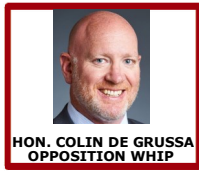
HON. COLIN DE GRUSSA OPPOSITION WHIP