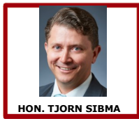
HON. TJORN SIBMA