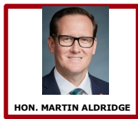
HON. MARTIN ALDRIDGE