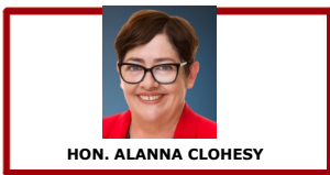
HON. ALANNA CLOHESY