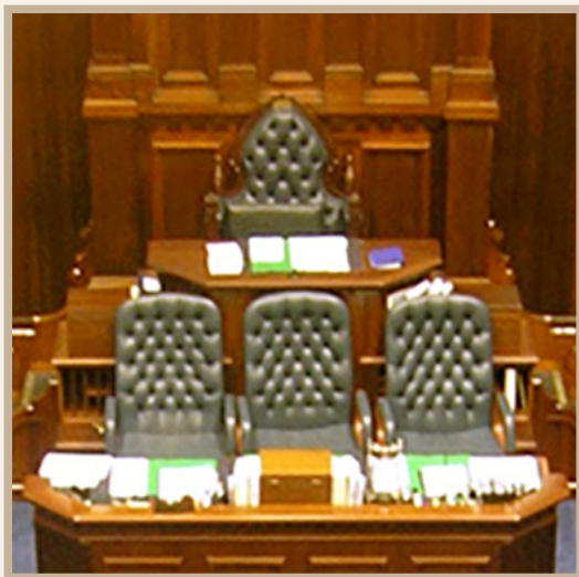
Speaker's location in the Legislative Assembly Chamber

The role of the Speaker is an ancient and important office of the Westminster parliamentary system. The first person to be called the Speaker of the House of Commons was appointed in 1377. The name Speaker dates from a time when the House of Commons 1 was only allowed to address humble petitions to the Crown through its appointed spokesman, the Speaker. The procedure of the House of Commons revolved around talking until the opinion of the majority was discovered. Once the majority opinion was agreed on, the Speaker was sent to express it to the Crown. At least nine British Speakers are known to have died a violent death because the monarch did not want to hear what the Speaker had to say or agents of disgruntled barons and lords carried out similar persecution. The position of Sergeant-at-Arms was created in order to protect the Speaker from harm.