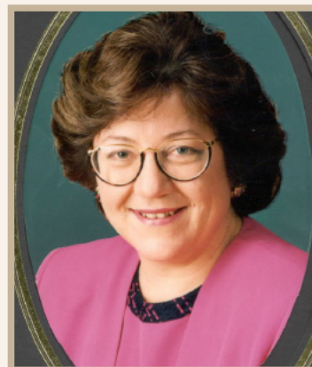
Dr Carmen Lawrence