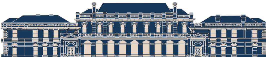
Parliament House of Western Australia. 4 Harvest Terrace, West Perth.