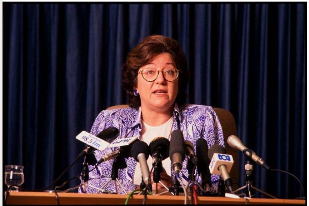
Dr Carmen Lawrence, first woman Premier of Western Australia

Carmen Lawrence (ALP) became Western Australia's first female Leader of the Opposition on 16 February 1993 after the ALP's defeat at the state election. Previously she had been Premier, Treasurer and Minister for Employment. She served as Leader until resigning in February 1994 until her election as the federal Member for Fremantle on 12 March 1994.