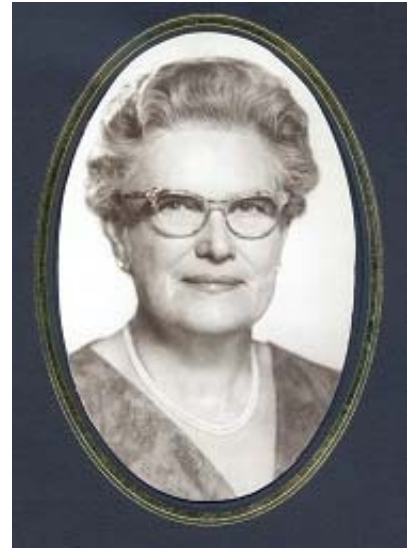
Ruby Hutchison

Ruby Hutchison (ALP) was the first female Member of the Western Australian Legislative Council. Hutchison was elected to the Western Australian Legislative Council on 8 May 1954 and began her term on 22 May 1954. She represented the Suburban Province. She was the first woman elected to an Australian Legislative Council. During her seventeen years she was the only woman MP in the chamber.