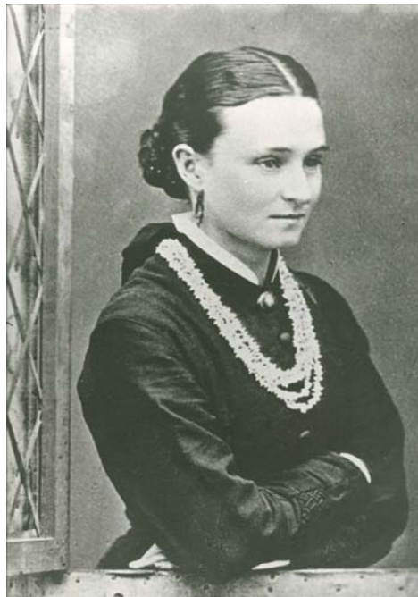
Edith Cowan, c.1880s