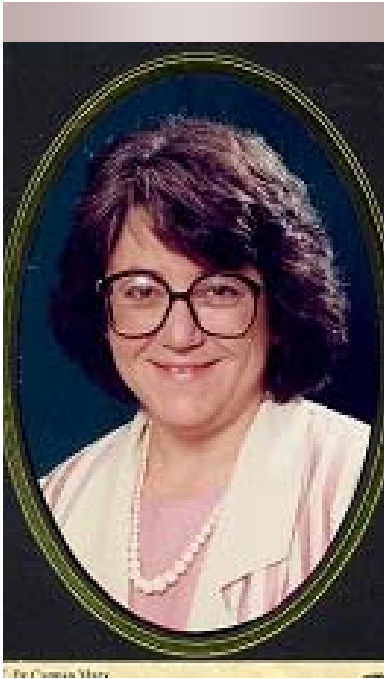
Carmen Lawrence