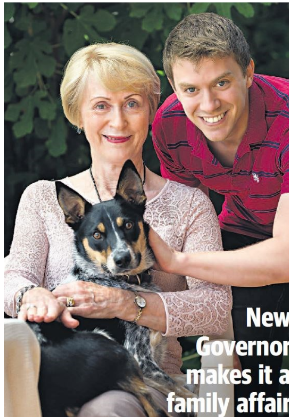
'New Governor makes it a family affair'

Kerry Sanderson AO has received many prestigious awards. In 1996 she was awarded the Telstra Business Woman of the Year. In January 2001 she received a Centenary Medal for service to the maritime industry. She was awarded the Officer of the Order of Australia (AO) on 14 June 2014: 'for service to the development and management of the port and maritime industries in Australia'. The University of Western Australia gave her an Honorary Doctorate of Letters in 2005. She was also awarded an Honorary Doctorate from Murdoch University in 2015.