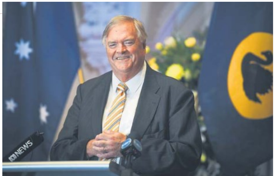
'Kim Beazley says his new role is daunting'