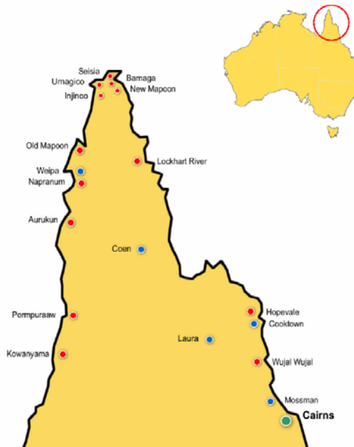
Figure 2.1 Cape York 19

The following background on Cape York is extracted from various websites and reports related to Mr Pearson's initiatives: 20