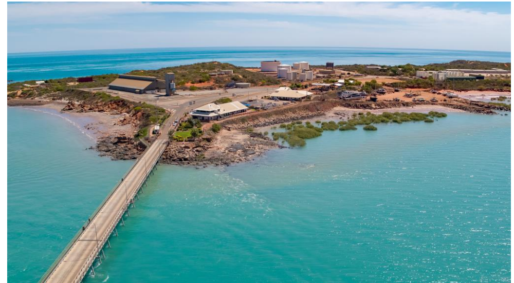
Figure 1 Port of Broome - onshore

In addition, it should be acknowledged that this SCI, and the associated financial information, may alter in the future in response to a range of factors beyond KPA's control, including unforeseen growth opportunities, and/or trade reductions.