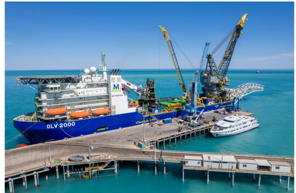
Figure 2 McDermott's DLV 2000 – offshore construction vessel

Environment - We care for our environment.