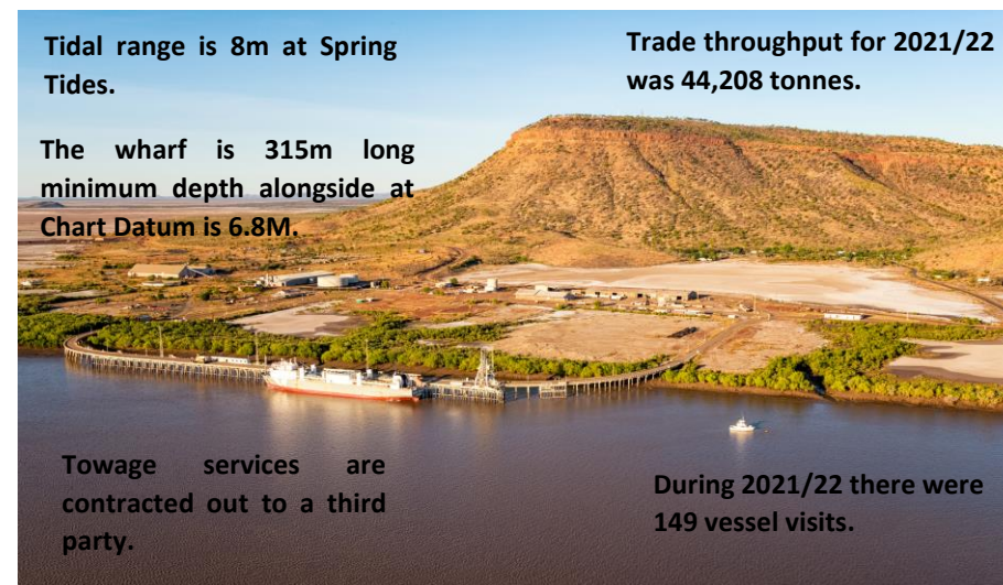
Figure 5 Aerial view Port of Wyndham

KPA's Port of Wyndham is a landlord model port and is operated by Cambridge Gulf Ltd (CGL), with Kimberley Metals Group Logistics Pty (KMG) operating an iron ore export facility to the North of the Port. CGL have a 10 year lease and management agreement to operate the port, commencing from 1 July 2021.