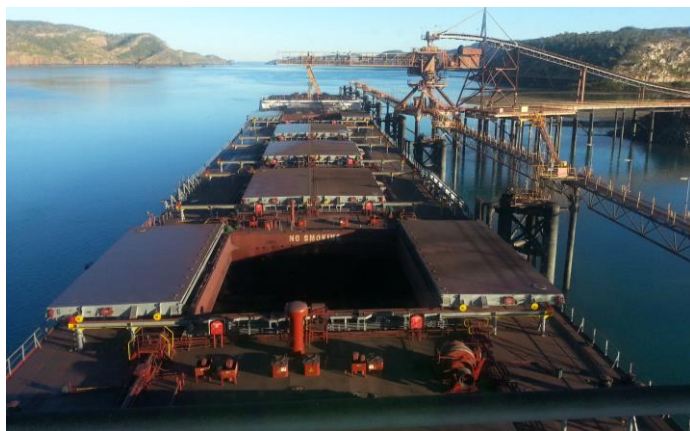
Figure 6 Koolan Island ship loading

In considering the current trade environment and future growth opportunities KPA has produced the following trade forecast for vessel visits and tonnages throughput at the ports.