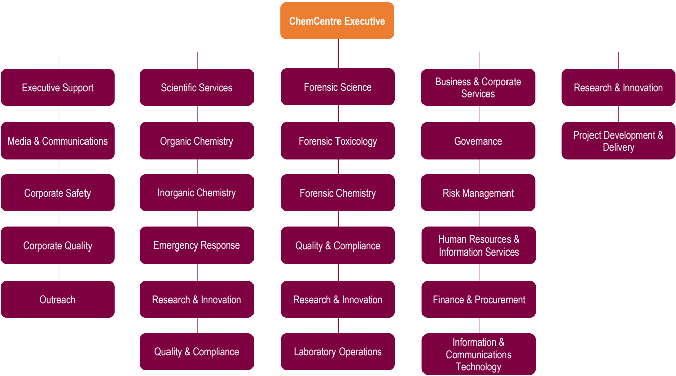
Table 2. ChemCentre’s Functional Areas

The planned operating income and expenditure for ChemCentre over the planning period is outlined in Appendix 1 and the Key Performance Indicators are outlined in Appendix 2.