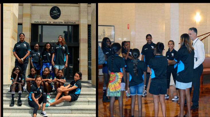
Students visiting Parliament House from One Arm Point RCS

We remind our country teachers that the Country School Travel Subsidy applies to schools located 150 to 260 kilometres from Perth. Further information about this program is available here: