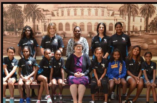
Students with Hon Kate Doust MLC, President of the Legislative Council